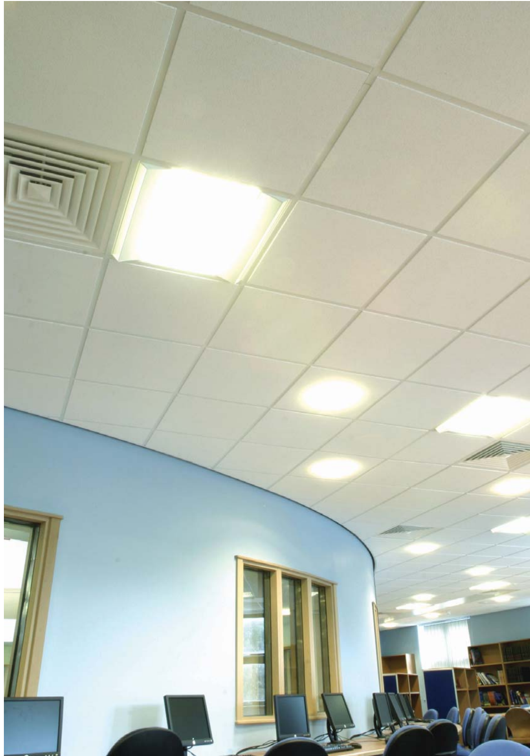
Dune Max MicroLook